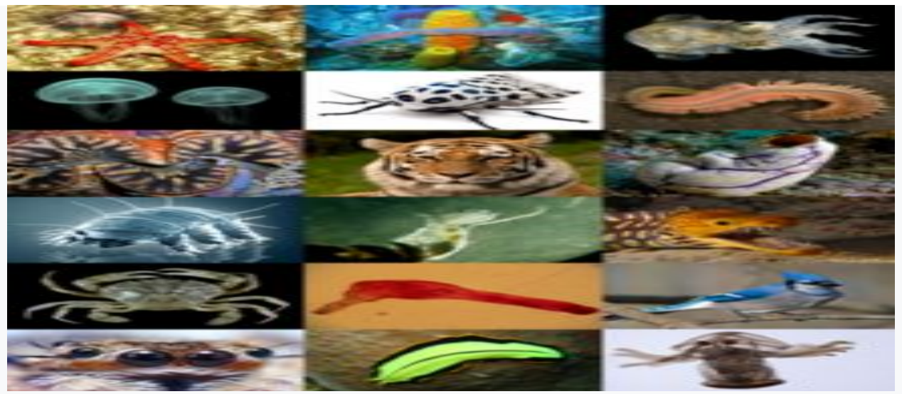
An example of the many animal species on the Earth.