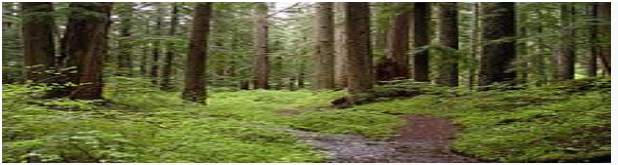
Old-growth forest and a creek onLarch Mountain, in the U.S. state ofOregon.

Central to the ecosystem concept is the idea that living organisms are continually engaged in a highly interrelated set of relationships with every other element constituting the environment in which they exist. Eugene Odum, one of the founders of the science of ecology, stated: "Any unit that includes all of the organisms (ie: the "community") in a given area interacting with the physical environment so that a flow of energy leads to clearly defined trophic structure, biotic diversity, and material cycles (i.e.: exchange of materials between living and nonliving parts) within the system is an ecosystem."<sup>[27]</sup>